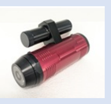
Mobile near-infrared analyzer M011