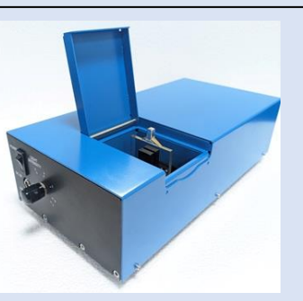
Portable near-infrared analyzer ype Transmission type 22 M021/M023