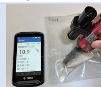
Fruit sugar content measurement